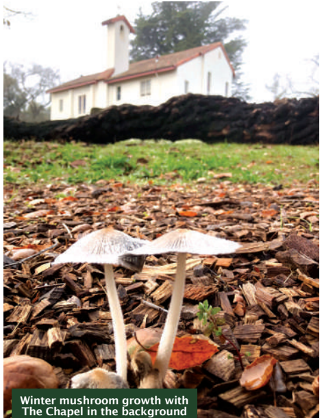
Winter mushroom growth with The Chapel in the background