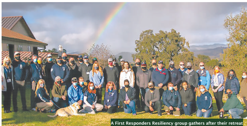
A First Responders Resiliency group gathers after their retreat

The Ranch is proud to have become home to regional First Responders Resiliency retreats. In 2022, more than 185 firefighters, EMTs and other first responders participated in three science-based education and trauma-informed retreats to address stress management related to the vital and challenging work they do to save lives. Responders enjoy rest, rejuvenation, and play at The Ranch, and often refer to their time at The Ranch as “life-changing.”