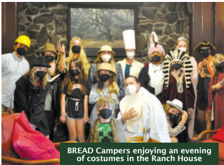
BREAD Campers enjoying an evening of costumes in the Ranch House

— Ren, 6, first-time Intergenerational Camp participant