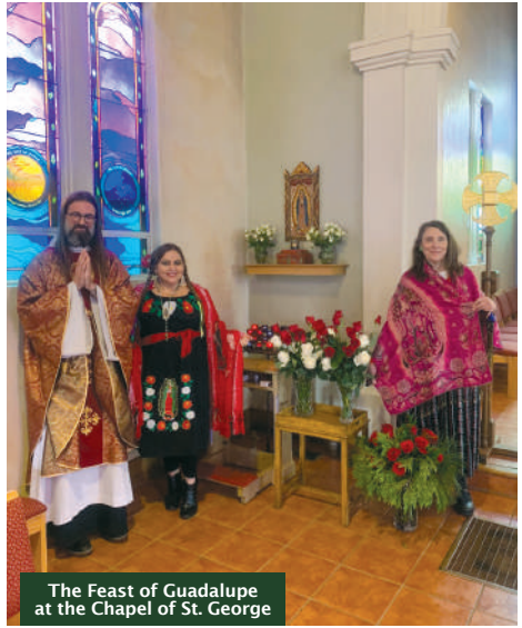
The Feast of Guadalupe at the Chapel of St. George