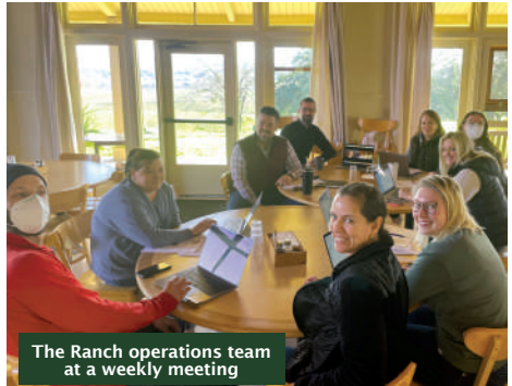
The Ranch operations team at a weekly meeting