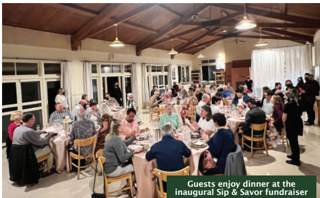
Guests enjoy dinner at the inaugural Sip & Savor fundraiser