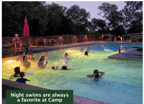
Night swims are always a favorite at Camp