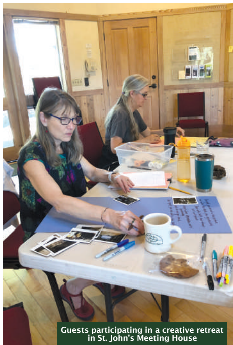
Guests participating in a creative retreat in St. John's Meeting House