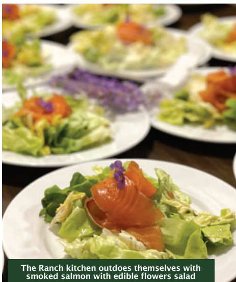
The Ranch kitchen outdoes themselves with smoked salmon with edible flowers salad