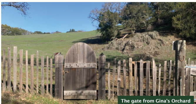
The gate from Gina's Orchard