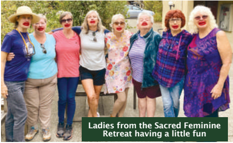
Ladies from the Sacred Feminine Retreat having a little fun