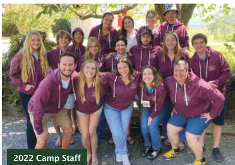
2022 Camp Staff