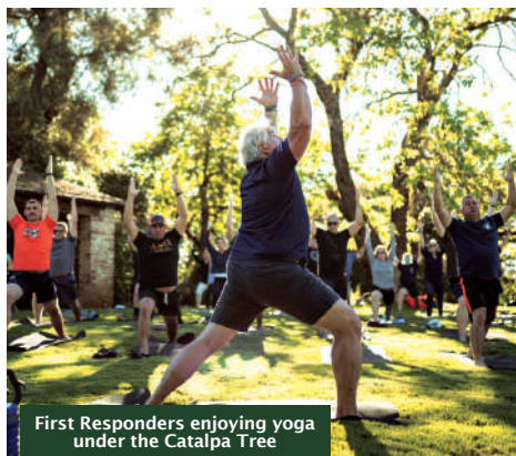
First Responders enjoying yoga under the Catalpa Tree