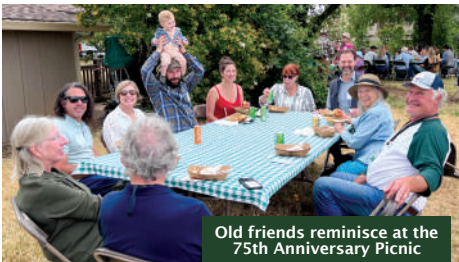
Old friends reminisce at the 75th Anniversary Picnic