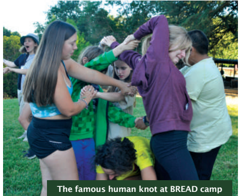
The famous human knot at BREAD camp

"The mission of the Ranch is to serve God by providing for people of all walks of life a place where lives are changed; a place of hospitality amidst the beauty of God's creation where renewal of spirit, mind, and body is nourished, leading to spiritual growth and closer relationships with God and one another."