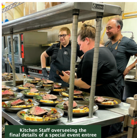
Kitchen Staff overseeing the final details of a special event entree