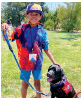
A READ camper walks Bosco, the therapy dog