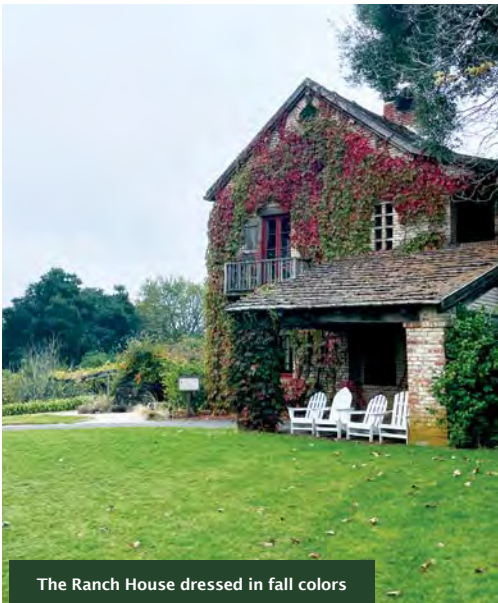
The Ranch House dressed in fall colors