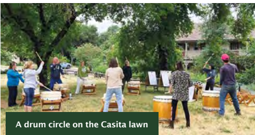
A drum circle on the Casita lawn