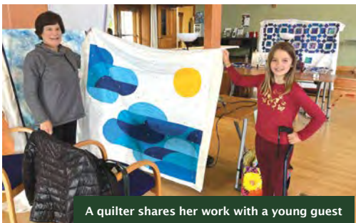
A quilter shares her work with a young guest