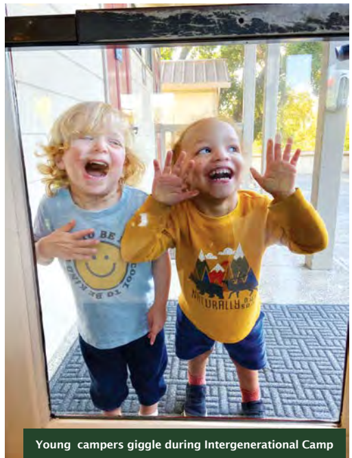
Young campers giggle during Intergenerational Camp