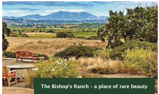
The Bishop's Ranch - a place of rare beauty