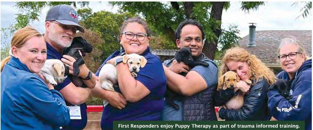
First Responders enjoy Puppy Therapy as part of trauma informed training.