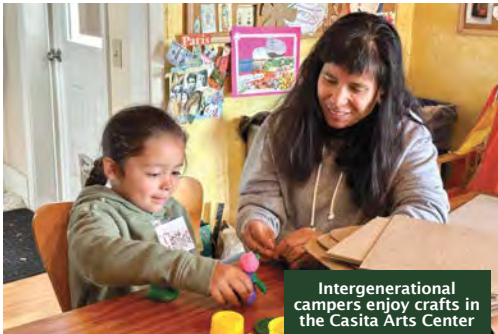
Intergenerational campers enjoy crafts in the Casita Arts Center

Twenty outstanding seasonal staff, including counselors, chaplains, nurses, teachers, and musicians, joined The Ranch team to create a summer camp season to remember.