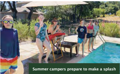
Summer campers prepare to make a splash