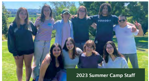
2023 Summer Camp Staff