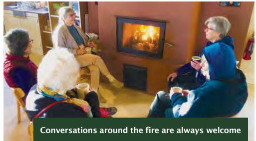
Conversations around the fire are always welcome