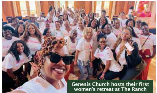
Genesis Church hosts their first women's retreat at The Ranch