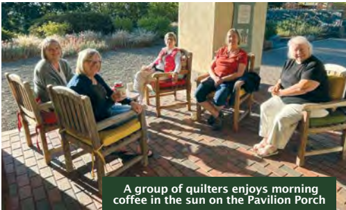
A group of quilters enjoys morning coffee in the sun on the Pavilion Porch