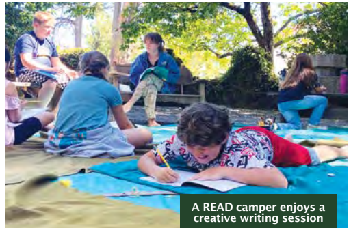
A READ camper enjoys a creative writing session