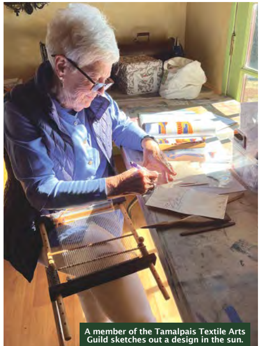
A member of the Tamalpais Textile Arts Guild sketches out a design in the sun.