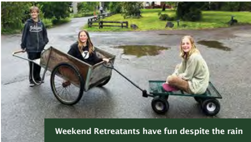
Weekend Retreatants have fun despite the rain

To share a place of rare beauty through hospitality that nourishes spirit, body, and mind.