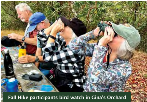
Fall Hike participants bird watch in Gina's Orchard